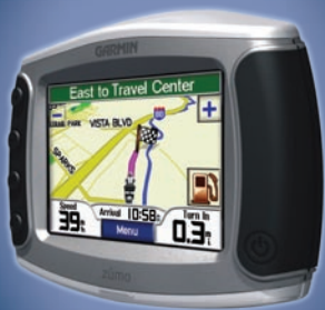
the personal motorcycle navigator

© 2006–2007 Garmin Ltd. or its subsidiaries Garmin® is a trademark of Garmin Ltd. or its subsidiaries, registered in the USA and other countries. zūmo™ is a trademark of Garmin Ltd. or its subsidiaries. These trademarks may not be used without the express permission of Garmin. The Bluetooth® word mark and logos are owned by the Bluetooth SIG, Inc., and any use of such name by Garmin is under license. For the latest free software updates (excluding map data) throughout the life of your Garmin products, visit the Garmin Web site at www.garmin.com .